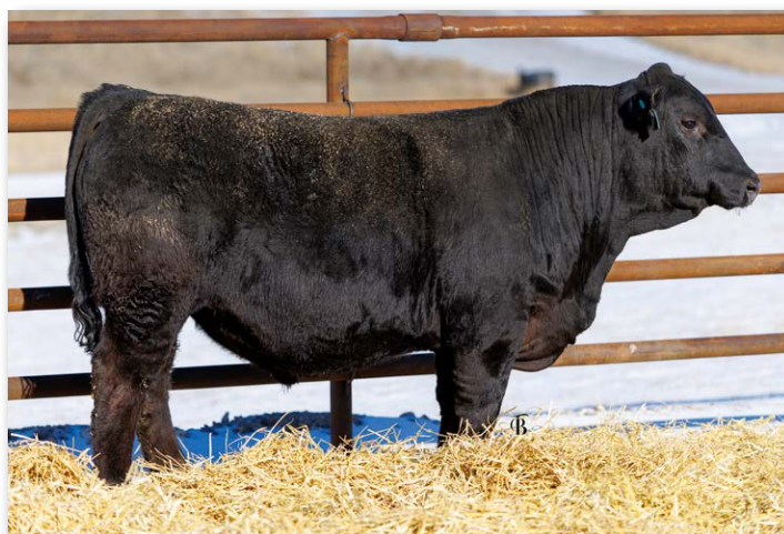
JJK PONTIAC N532 Sells as Lot 21.

Bosie Dam produced this medium framed bull with top 10% REA.