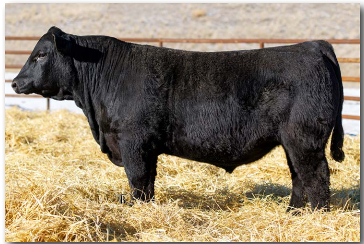
LBRS NEWSBREAK N701 Sells as Lot 1.

A exceptional set of flush brothers in lots 1-3! This mating has done everything we hoped for and then some. Tremendous spread from birth to yearling and top maternal rankings for CE, Milk and Stay backed by PLR Sapphire and Gibbs Louise. Newsbreak is the complete package, being clean made with extra length and correctness from end to end. He does carry the red gene for those interested in producing the next generation of reds.