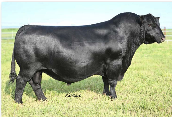
BASIN JAMESON 1076 Sire of Lot 22.