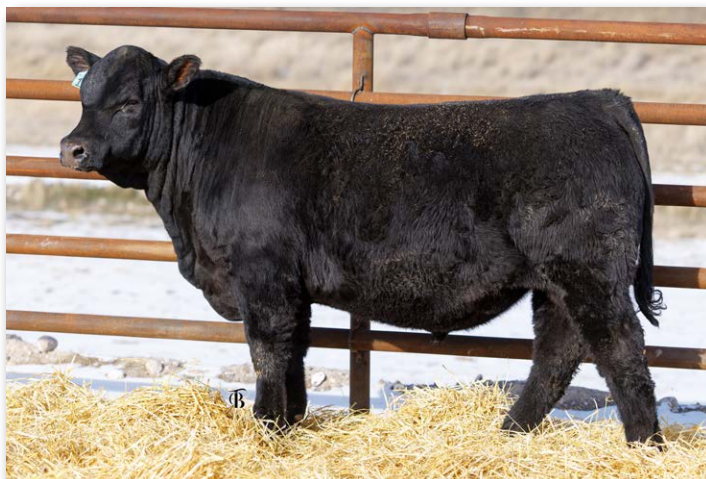
FAUTH GIBBS MR 509N Sells as Lot 118.

116 is out of a home raised bull. We think he could possible be a great option to had some new genetics in red cattle.