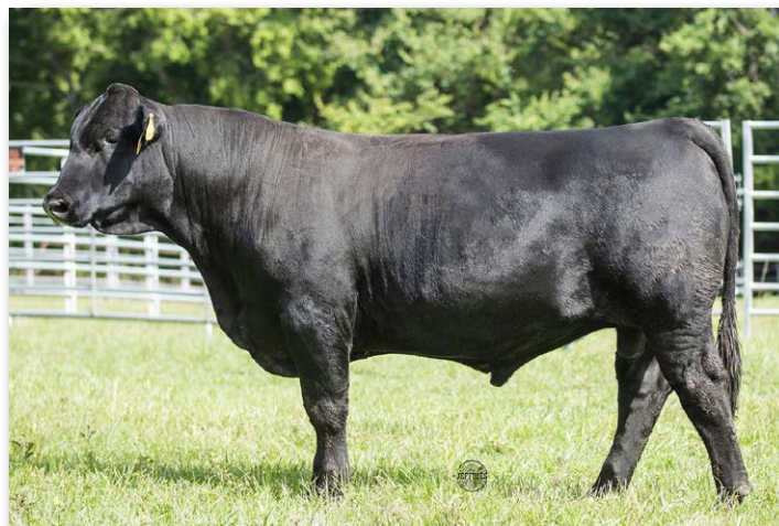
HA JUSTICE 30J Sire of Lot 26.

Lot 26 is offering a smaller Justice son with 8 EPDs in the top 10%. Would make a nice heifer bull.