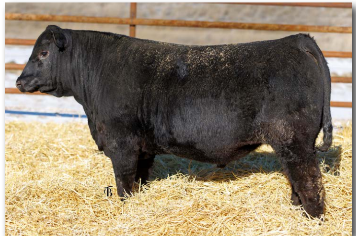
LBRS NITRO N703 Sells as Lot 2.

Nitro is very similar to lot 1 in his makeup and type with just a touch more growth. The Signatures are all exceptional for disposition and were the ones to always come say hello when you were out in the field.