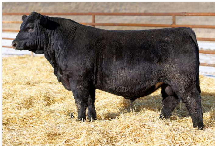
JJK BEDROCK N538 Sells as Lot 25.

Bedrock sire and Commander dam making for offspring with balanced EPDs.