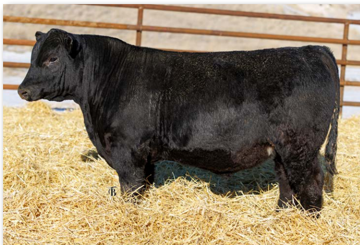
LBRS NATIONAL N173 Sells as Lot 4.