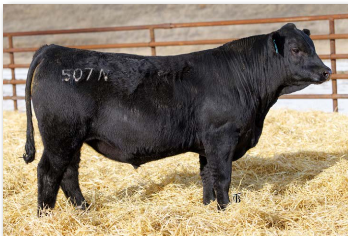
FAUTH MR TALON 507N Sells as Lot 99.