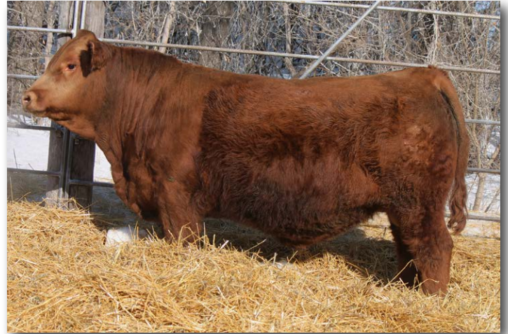
KBHR CHARGER K102 Sire of Lots 121-123.

If you are in need of an outstanding red PB heifer bull, then lot 122 is your bull! He is a 5 G+, ACE with an 185 API, out of an elite, young Direct Impact dam.