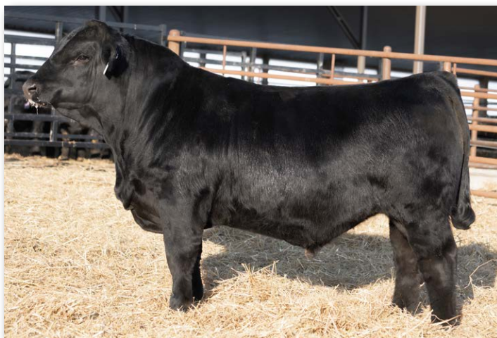
CLRS JOHNNY WALKER 1049J Sire of Lot 69.