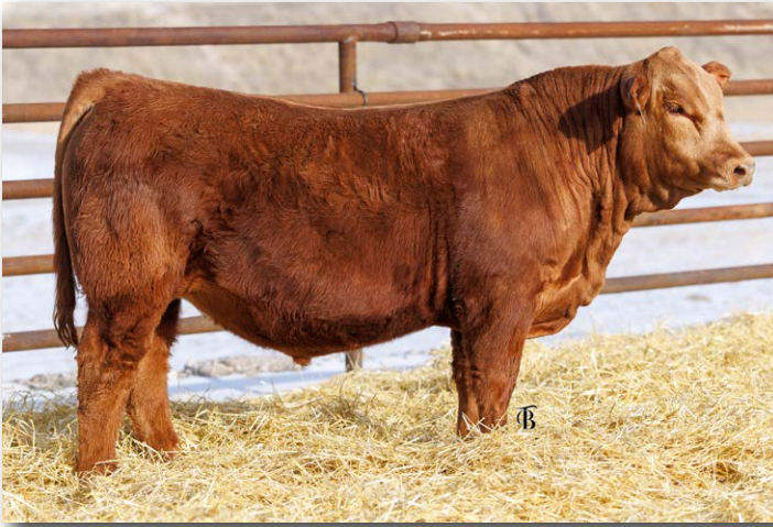
MFSR GRAND JUNCTION 039N Sells as Lot 159.