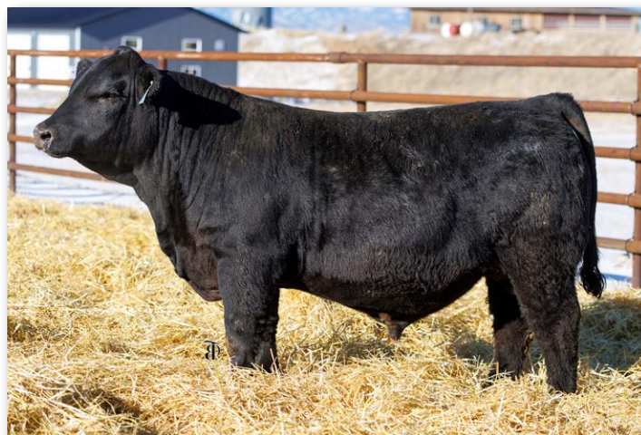
14JN Sells as Lot 54.

This Embryo calf out of a great Triangle J cow has been a standout since birth and is continuing to impress us. He weaned at 753lbs.