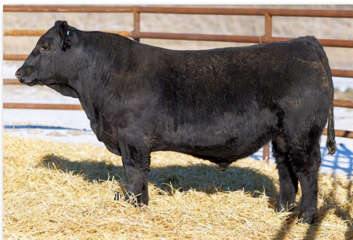
FAUTH MR AMERICA 593N Sells as Lot 80.

79 in probably the strongest phenotype bull in this flush and carries the 5 G+ and ATM badges.