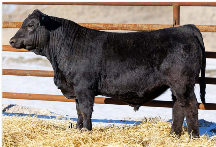
RYMO NEXT TYCOON N54N Sells as Lot 172.