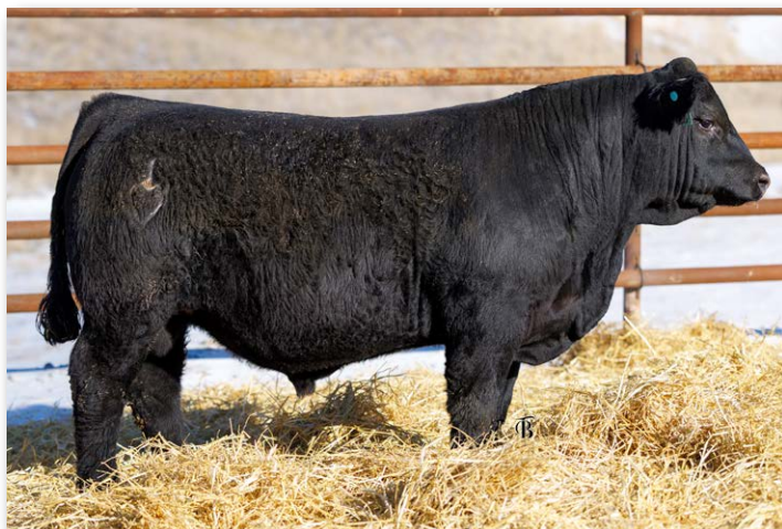
RYMO MEDICINE MONEY H21N Sells as Lot 195.

Super nice calf that comes with all the bells and whistles. He really has no holes in his EPD profile. He start off as a nice 78 pounder and cruised up to 815 lbs. for weaning with a 109 ratio.