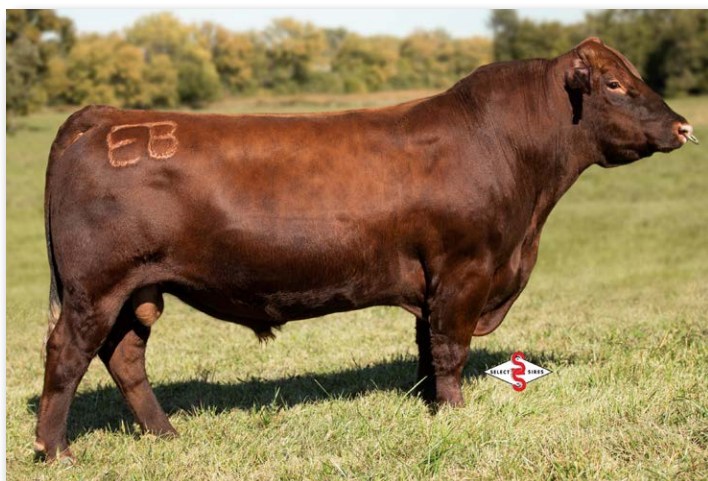
GW HILGER ONE 454H Sire of Lots 146-151.