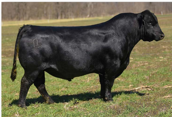
C-3 NEXT UP NS B220 J939 Sire of Lots 169-175.