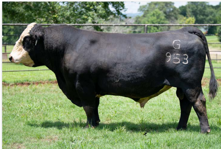
C-3 GROUND BREAKER NS G953 Sire of Lots 165, 167, 168.

H77N is medium to smaller frame than Lot 165 but very attractive and eye appealing. He comes with more of the All Purpose Index power with top rankings in STAY, DOC, Marb, and DMI. His dam just finished up with her 8th and 9th calves, with a CI of 359 days and 108 IMF ratio.