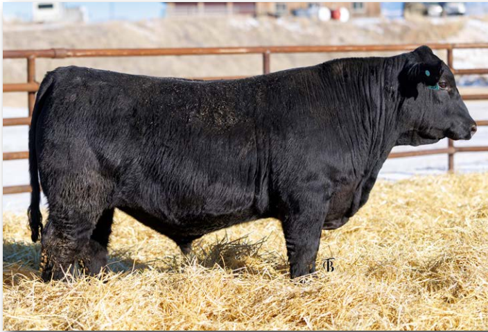
MFSR ESSENTIAL 212N Sells as Lot 125.

Miller Simmental's first offering of a recip calf -- one look at him, and you will see why this is the future of cattle reproduction.