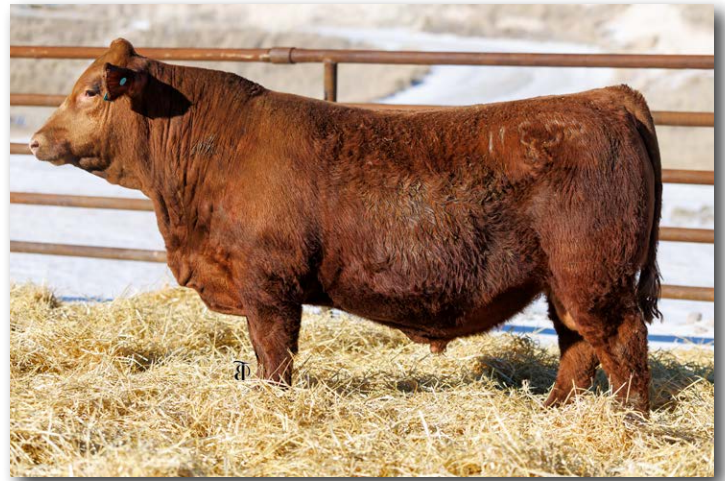
FAUTH MR CHARGER 523N Sells as Lot 121.

Lot 121 is a power house Charger son. Great ATM bull out of a phenomenal Major Mover dam.