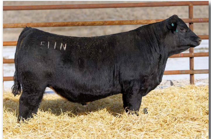
FAUTH MR PONTIAC 511N Sells as Lot 82.

82 is a G+ Pontiac son we feel would excel as a heifer bull. More moderate, and a stud to look at.