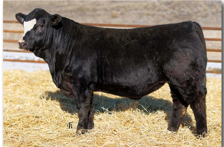
MFSR START FIRST 053N Sells as Lot 143.