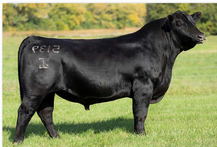
G A R TRANSCENDENT Sire of Lot 191.

GAR Transcendent is the leading marbling Angus bull. He makes beautiful, deep sided, big ribbed daughters and his sons are exceptionally attractive on paper and in person. Lot 191 is out of a 2nd calf heifer and check out his CE of top 3%. Top 4% API and 10% TI makes him a money maker at every end. He started at 74 lbs. and weaned off at 790 lbs.