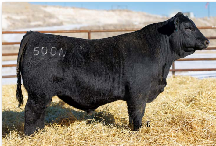
FAUTH MR NEXT UP 500N Sells as Lot 85.