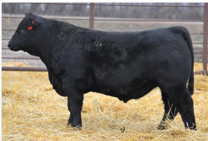
WS JESSE JAMES 31J Sire of Lots 95-97.

Gentle, free moving Bonafide son, long and correct.