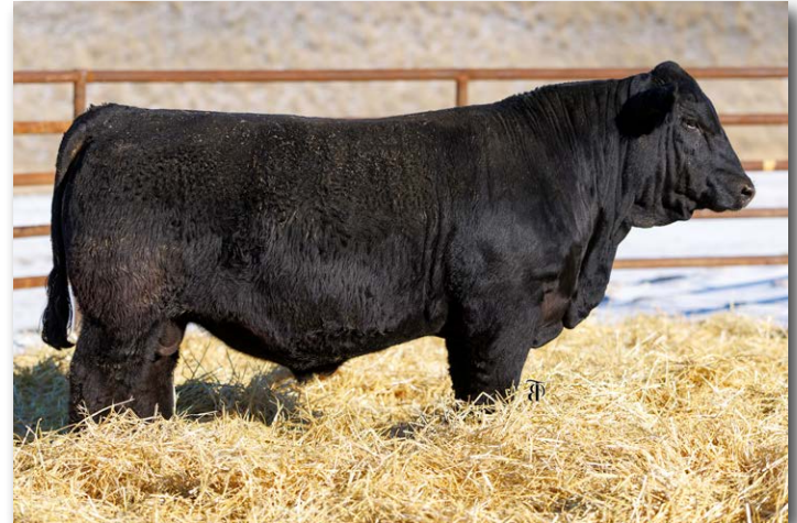
RYMO UP SHOT R27N Sells as Lot 200.