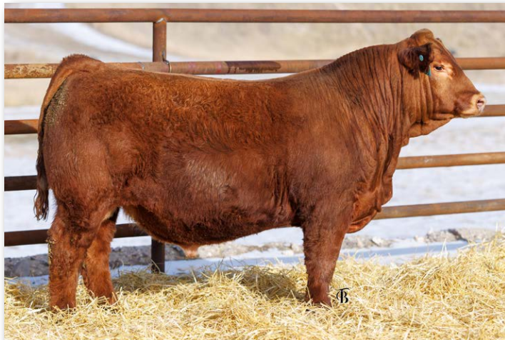
MFSR CARDINAL 310N Sells as Lot 153.