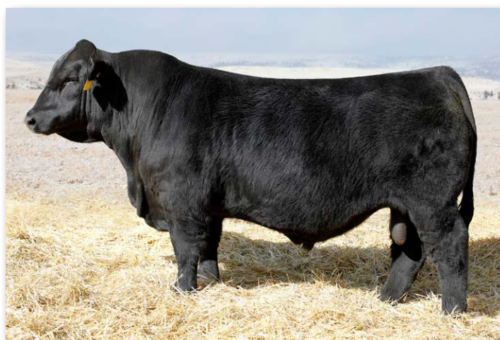
KBHR HONOR H060 Sire of Lot 27.

Smooth moving, well-structured PB bull. REA in the top 15%.