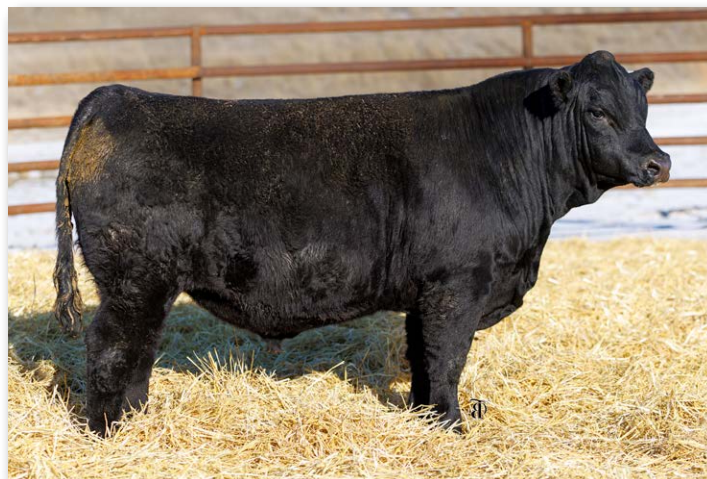
RYMO DUTTON LAND P96N Sells as Lot 216.

Lot 215 and 216 are from the same cow family. Lot 216 is moderate and balanced. His numbers are not as impressive on the growth side but if you are watching your DMI, he ranks in the top 2% and 25% for $GN.