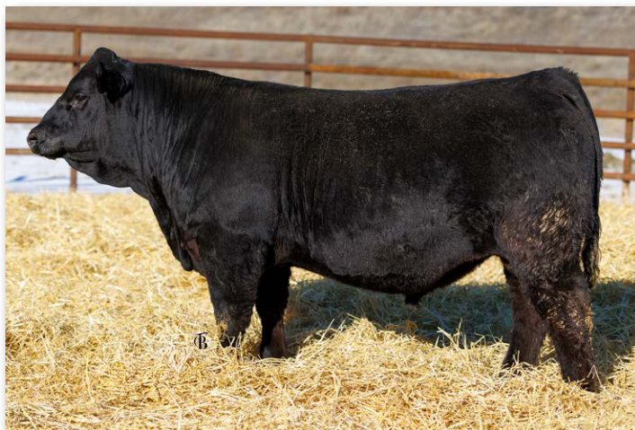
LBRS NITRO N76 Sells as Lot 5.

National is a great calving ease prospect and heifer safe with his Ace logo. Like all the Signatures he has put on the pounds since going on test. His dam is a deep bodied Franchise daughter that has done really well for us.