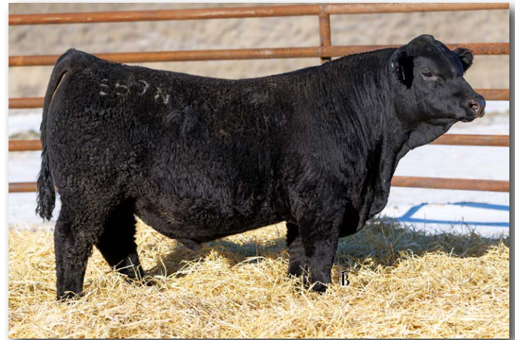
FAUTH MR RAWHIDE 553N Sells as Lot 103.