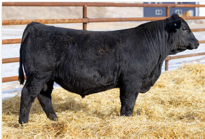
JJK HONOR N581 Sells as Lot 19.

An Honor son with a solid base and calving ease. He's got 5 EPDs in the top 15%.