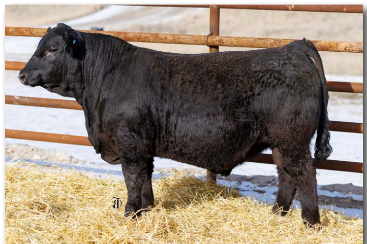
LBRS NAKODA N32 Sells as Lot 3.

Nakoda is an absolute stud! A bull that is deep ribbed, stout made and very attractive on the move. He has shown his ability to add growth as he was the top gainer for LBRS over the first weigh period. We are extremely excited about how he has progressed on test, but believe the real place he will shine is in the beautiful females that he could produce.