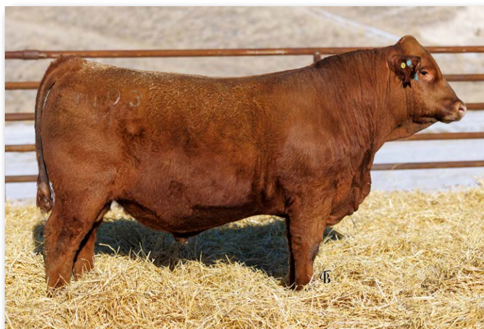
FAUTH MR CHARGER H103M Sells as Lot 68.

Being a Charger son and by the great Crystal dam, this age advantage red bull is the total package! 5.81 lbs ADG. We predict his calves to come easy & take off from birth.