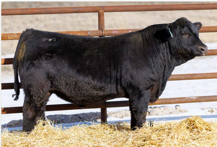
LBRS NAVIGATOR N344 Sells as Lot 11.