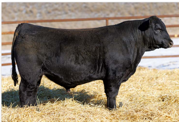
RYMO NEXT CAMP N43N Sells as Lot 171.

You will look like the smartest cowboy with this one in your pasture. Super deep, stylish, and an easy favorite to look at. Then, you add the genetic side of things and his top 10% API and TI will help you all the way to the bank.