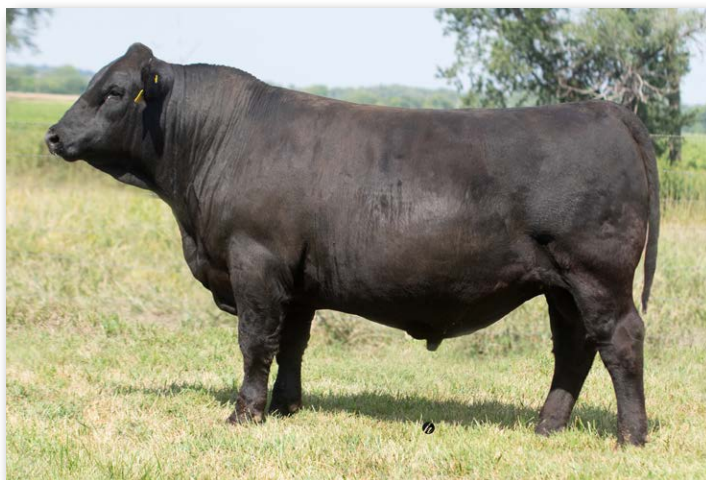
IR/JLN BOOMER J425 Sire of Lots 50, 51.