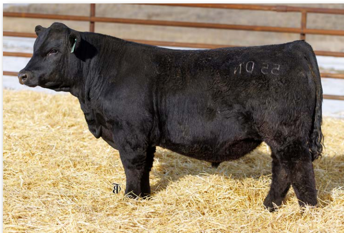
FAUTH MR BONAFIDE 550N Sells as Lot 94.

93 is a big, deep sided Bonafide son off a great first calf heifer. Perfect feet, and weaned off at 863lbs.