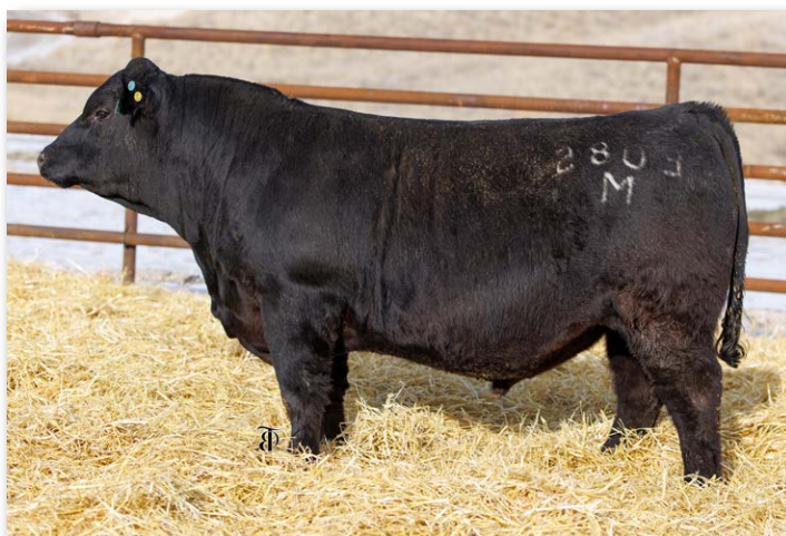
FAUTH MR RARITY E085M Sells as Lot 72.