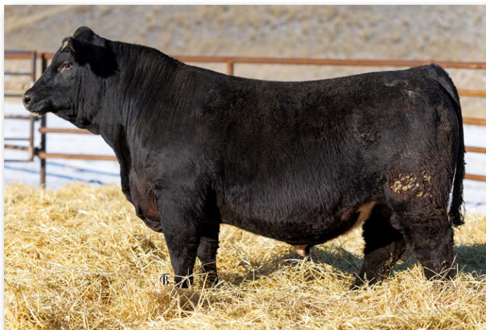
FAUTH MR RARITY 0907M Sells as Lot 71.