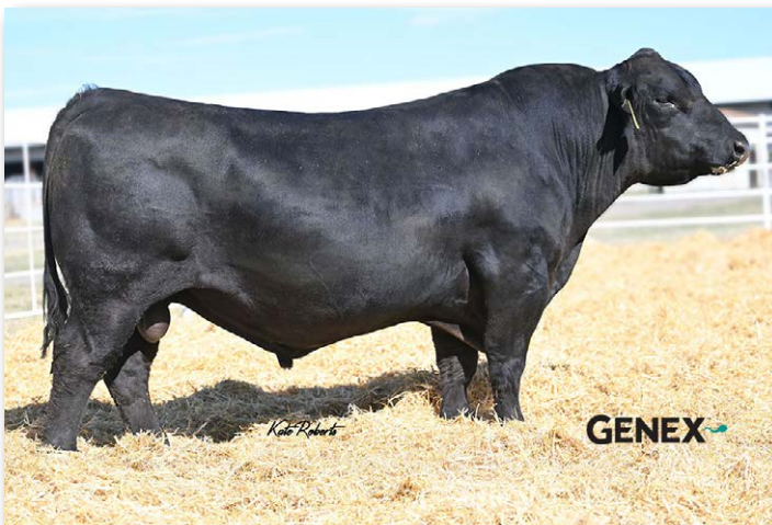
GIBBS 9114G ESSENTIAL Sire of Lots 125-128.

A Genesis dam meeting up with an Essential sire makes this calf a showstopper. His numbers should not be missed.