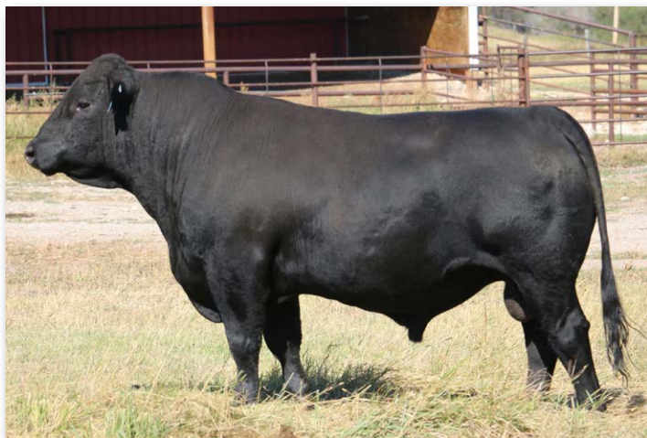
GW HIGH BALL 102H Sire of Lot 139.