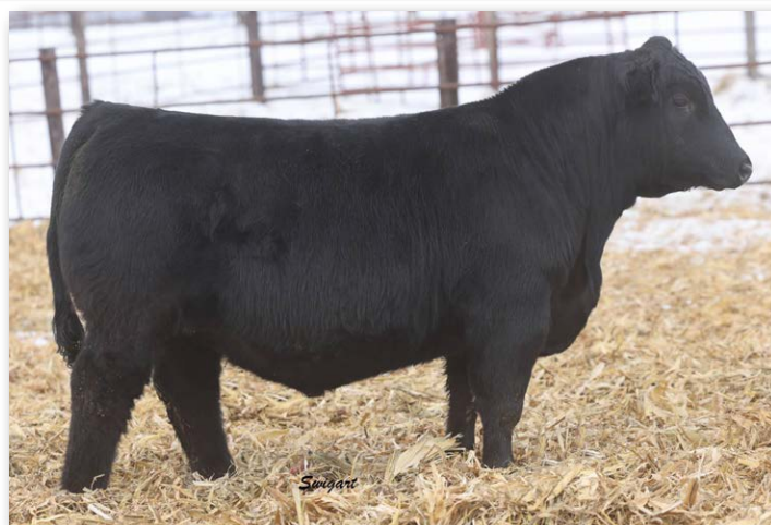
WBF PATTON K059 Sire of Lots 178, 179.

Lots 178 and 179 are twins, both raised by their dam. She weaned off over 1400 lbs. Just as you expect from the WBF Patton calves, they are solid calving ease with explosive growth. This turned out to be a great combo of dam and sire mating. Check out these boys. Lot 178 comes loaded with growth and carcass traits.