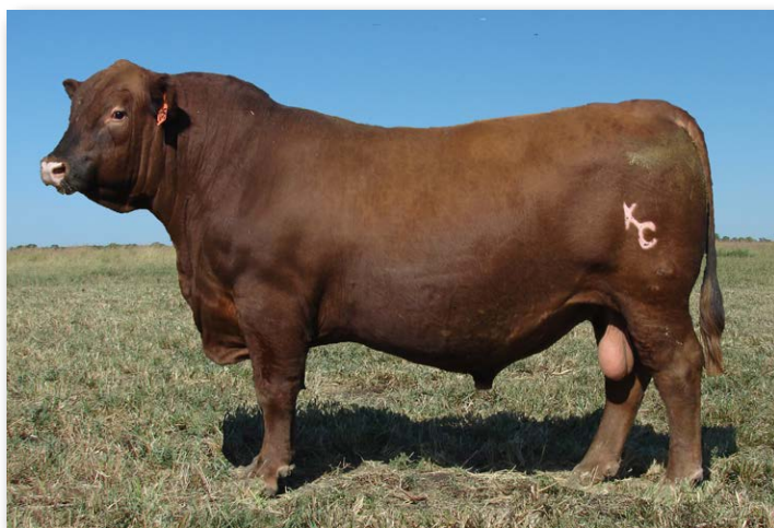
KCC JUDGE 258-J058 Sire of Lots 231-233.

KCC Judge was an exciting Red Angus bull that only had limited semen. This summer on pasture Marty was blown away with their look and performance of the bull and heifer calves out of Judge. Lot 231 is out of a cow with 12 calves and ratios of 104 WW, 102 YW, 108 IMF and a CI of 366 days. Can't go wrong from the maternal side.