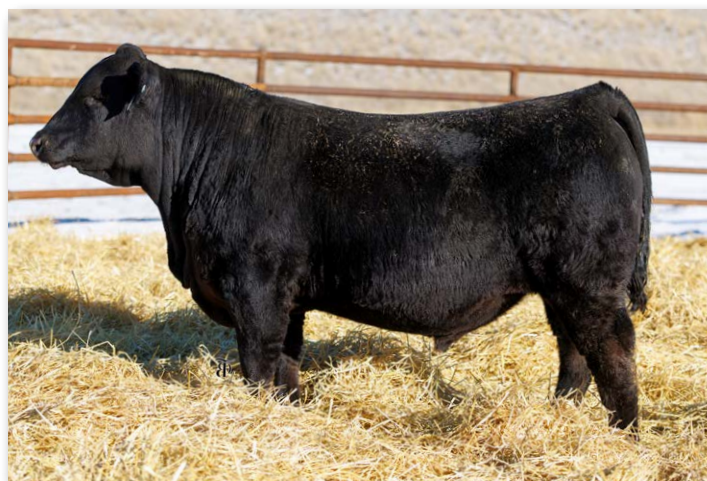
214KN Sells as Lot 56.

We really like our Iconic sons. Stout and powerful.