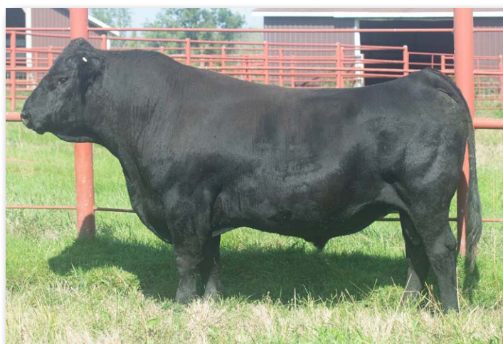
JC MR TALON 403G Sire of Lots 98-100.

Solid Talon son, off a great up and coming young cow.