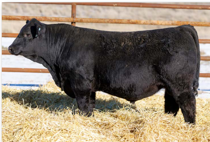
MFSR GLOBAL 211N Sells as Lot 138.