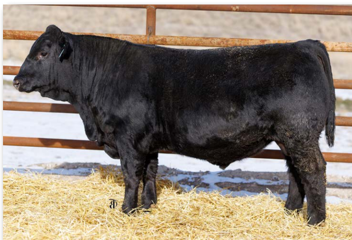
136LN Sells as Lot 53.