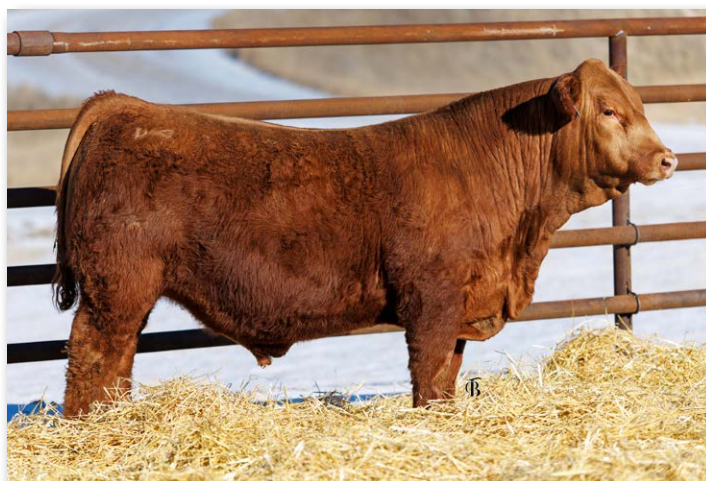
LBRS NOBILITY N17 Sells as Lot 15.

We used Logan to exploit the red gene to create the next generation of outcross reds. Nobility is the result and he is a good one, masculine, deep and structurally sound. He will add pounds to your next calf crop. His dam is a deep, broody Bieber Atomic half blood that we appreciate for her great udder structure.