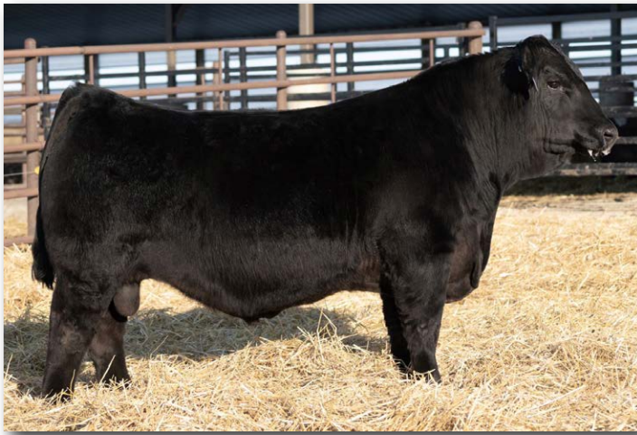
CLRS KING JAMES 616K Sire of Lot 124.