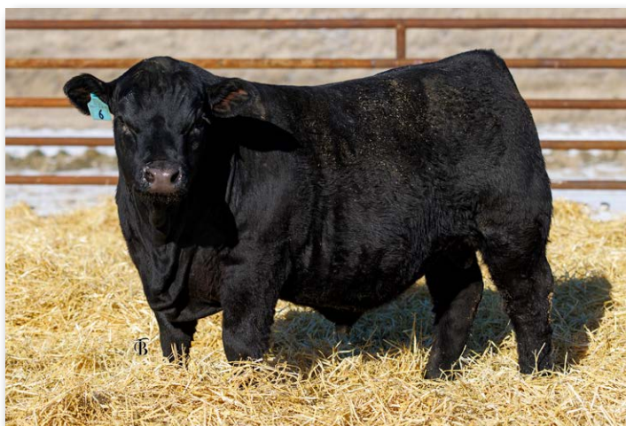
LBRS NARRATIVE N326 Sells as Lot 6.

Here's an opportunity to own a full sib to LBRS Integrity, who was last years high seller to Pleasant Hill Farms and Billingsley Farms. Phenomenal look and free in his movement with females and sires on both sides of the pedigree stacked for foot and udder quality. His dam entered the donor pen this last year and we are extremely excited about the calves that are hitting the ground as I type this footnote. Fault free genetics here with 11 EPDs in the top 25% or higher.