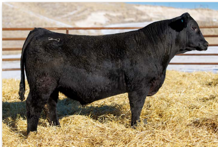
LBRS NOTEABLE N150 Sells as Lot 14.

Powerfully made Logan son with extra length and dimension throughout. LBRS Logan was the high-seller in the 2024 Bulls of the Big Sky Sale to Gaston Hornung and he is getting it done producing attractive sons and daughters that pack a lot of punch and grow. Notable himself has the physical makeup and build to cover some country being free moving and athletic in his stride. He is a bull, disposition wise, that likes just a little more personal space than some. His dam is a beautiful cow with a picture perfect udder and great feet.