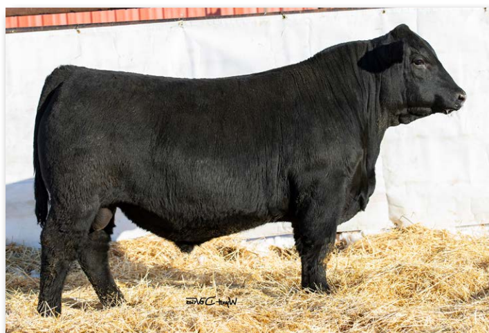
GW JAILBREAK 555J Sire of Lots 193, 194.

GW Jailbreak makes calves that makes repeat buyers with their consistency. Daughters are exceptionally deep, big bodied, moderate built. Lot 193 is just that. Check out his maternal traits that are top 4% MM, 5% Doc, and 15% for MWW, and Stay.