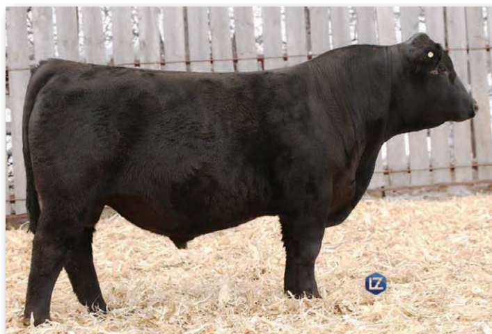
KBHR GLOBAL J138 Sire of Lots 137, 138.

Global sons might not be flashy, but they are just solid, stout, fundamentally sound calves.