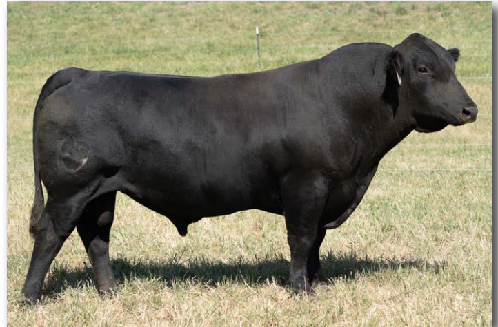
KBHR GUNSMOKE J131 Sire of Lots 74-79.

Theodore is the natural son of our J46 Black Powder daughter. 5 G+ bull that comes with a 100 TI as well. Top 3% of the breed for Marb.