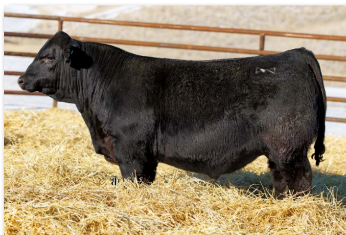
LBRS NAUTILUS N571 Sells as Lot 9.

Nautilus has been a standout from day one. Being one of the first LBRS Limited Edition bull calves we have watched excitedly as he has matured. He packs a lot of mass on a moderate frame. We can't say enough about his young dam. She is a deep broody female with flawless structure, great feet, beautiful udder and a quiet, easy going disposition. Heifer bull prospect that packs a punch with a Right Choice 5 G+ Ace badge.