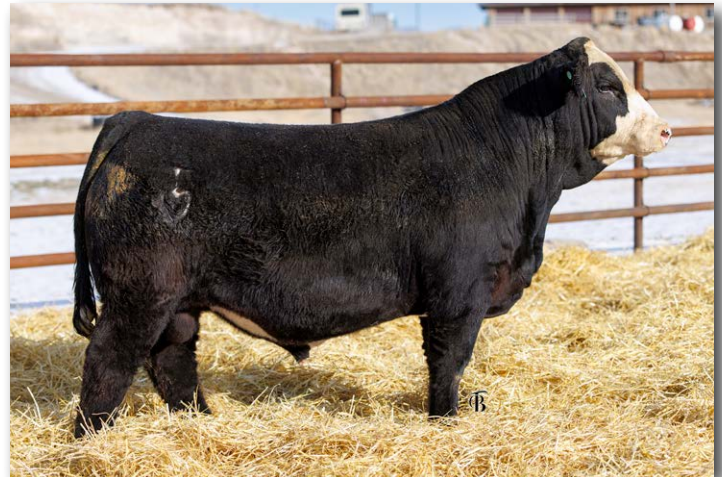
RYMO GENESIS AXIS G49N Sells as Lot 210.

LBRS Genesis is the #1 proven STI sire in the Simmental breed because his calves work. This is the 3rd Genesis x L49G mating because it works. Super deep and great performance with a white face and goggle eyes. Weaned off at 815 lbs. Here is an opportunity for a chromed growth and performance bull ranking in the top 10% API and 4% TI.