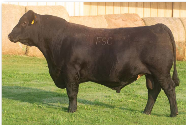
FSCR K048 FREELANCE Sire of Lots 187-190.

FSCR K048 Freelance has a once in a decade combination of trait values. He adds some frame, length and style to his calves. Lot 187 weaned off at 965 out of a first calf heifer with a 122 WW ratio. Check out his top 1% WW, 2% YW, and 5% ADG. Very clean made but heavy muscled.