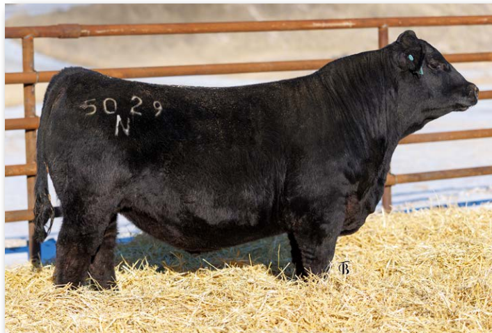
FAUTH MR 5029N Sells as Lot 110.

Musclemann son with an excellent disposition, off a great GW Break Thru cow. 85lb actual BW, with an actual WW of 800lbs, what a spread!