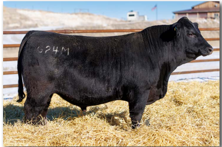
FAUTH MR RARITY G24M Sells as Lot 73.

73 is an eye popping flush brother to lots 71 and 72. G+