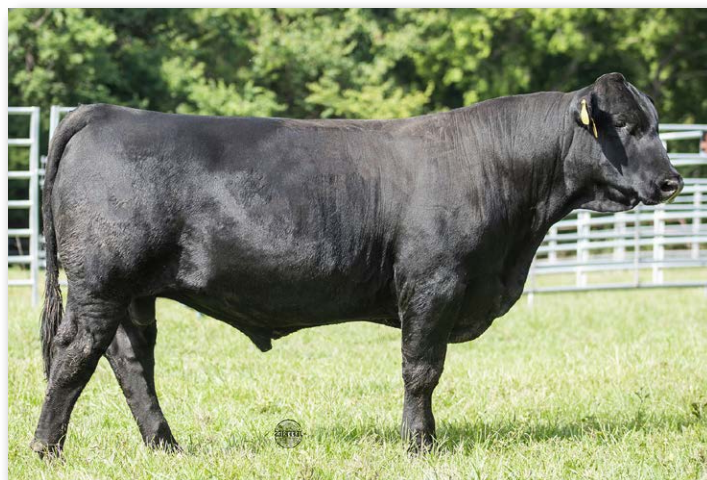
HA JUSTICE 30J Sire of Lots 132-135.