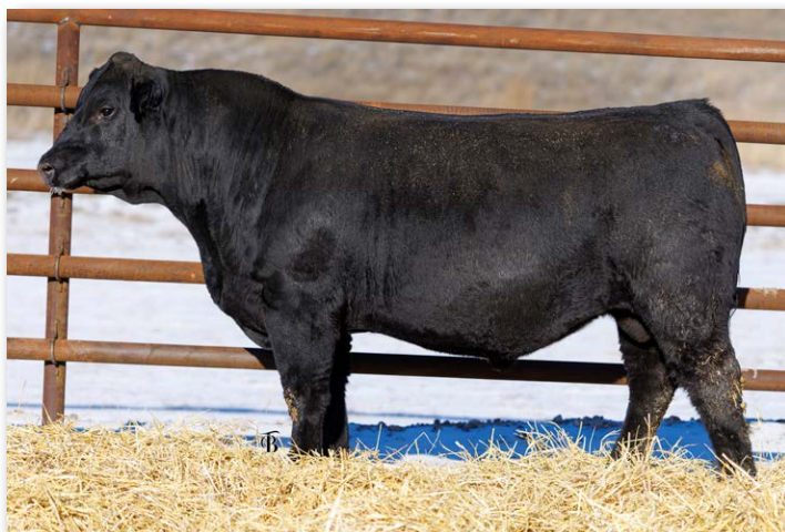
RYMO START FREE F01N Sells as Lot 187.