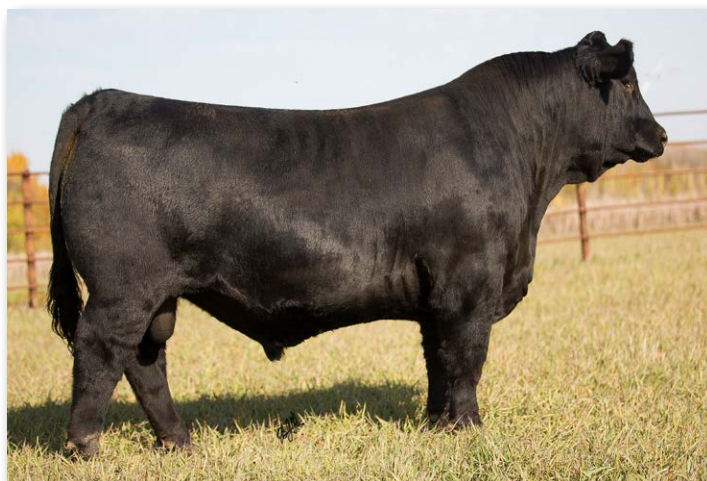
IRON CREEK NEVER SAY NEVER 9 Sire of Lots 111, 113, 114.

110 is our favorite Musclemann son at this year's sale. He is literally a whale of a bull. If one can be soft and square this is your guy! 5 G+. His Eagle dam does all things right! Whether she throws a heifer or a bull, they are keepers.