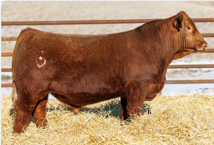
RYMO DESERT CELEBRATION B12N Sells as Lot 237.

Redhill Burley makes burley built calves. His calves improve structure and hoof quality. Lot 236 comes with a nice profile that places him in the top 20% API and TI. Very useful powerhouse.