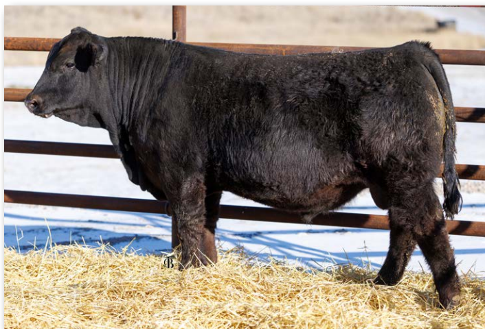
FAUTH MR 5035N Sells as Lot 116.