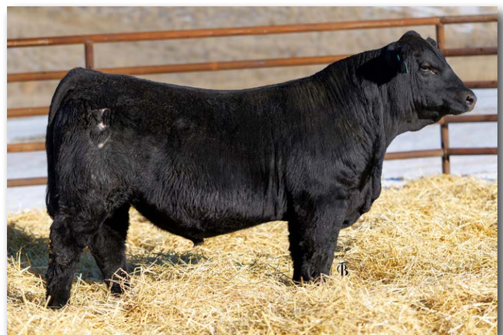
RYMO RESERVE THE RIGHT U21N Sells as Lot 211.

LCDR Reserve calves are super attractive with great feet, extra length and stretch. U21N was a twin raised by a graft but he was a favorite on pasture all summer. He is exceptionally balanced and fault free. He weaned off the graft dam at 910 lbs.