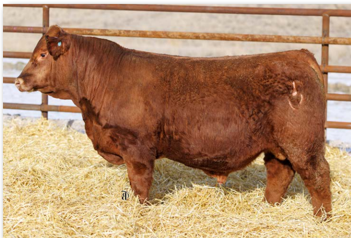
Q S CAKE CHARGED C75N Sells as Lot 229.