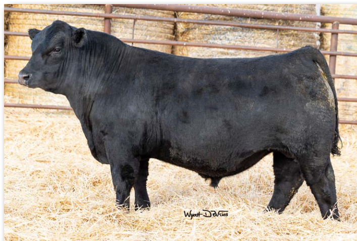
GW MEDICINE MAN 200K Sire of Lot 7.

A power house Medicine Man son out of the Kayla Donor. He is a twin to the lot 8 calf and they both hit the ground growing. We have numerous females in our herd and they are doing a great job passing on genetics that will keep you in business.