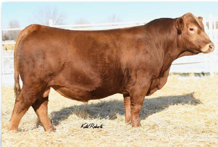
REDHILL BURLEY 99J Sire of Lot 64.

Lot 63 has been an eye catcher from day one. His momma did a nice job in some hard, dry pasture this summer, and this bull commanded a 738# actual weaning weight at not quite 5 1/2 months of age with no coddling. There's not much more you could ask of a stylish bull calf and his hard working, first calf dam. He's balanced across the board in his EPD profile, he sports an ATM Right Choice badge and offers a top 25% TI. Put him on a set of red cows for a fancy set of RWF calves and watch the heterosis burn.