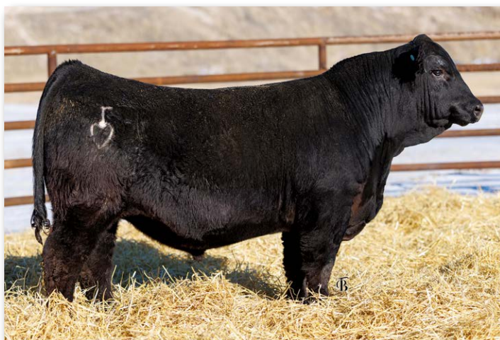
RYMO BLACK HAWK KING G28N Sells as Lot 183.

Lot 182 is deep, shorter in length but packed in between. Nice square hip and top. Out of a super moderate and easy fleshing cow. He ranks in the top 10% for ADG and 1% for $GN.