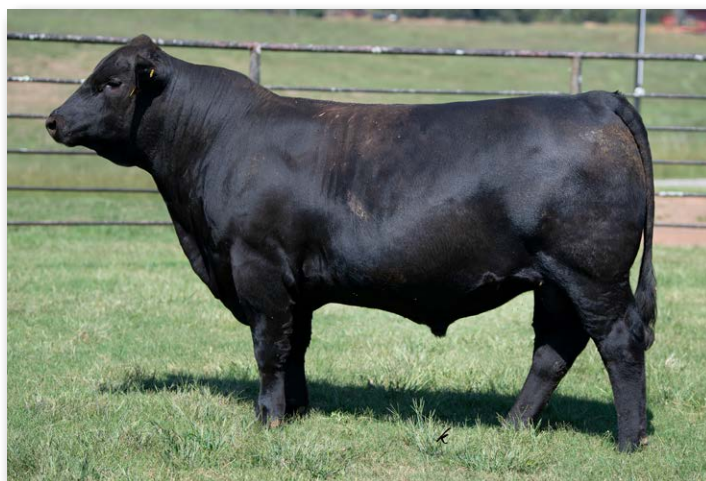
GIBBS SIGNATURE 2510K Sire of Lots 41-43.

Super docile, balanced EPDs with above average growth.