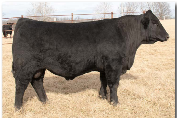
FHCC HONOR CODE 3165L Sire of Lot 186.

FHCC Honor Code makes long sided, calving ease calves with growth and rock star carcass traits. This long made son that will have lots of CE and overall use.