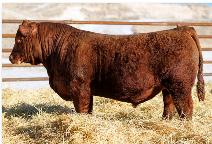
RYMO HILGERS FLAME M86N Sells as Lot 223.

Nice, well balanced brick of a red bull. Balanced numbers land him in the top 20% API and 15% TI.