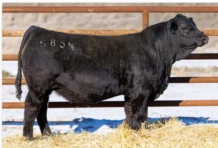
FAUTH MR KROWN 585N Sells as Lot 115.

115 is an own son of Schooley Krown, he also wears a Krown. 5 G+ and ATM. 9 traits in the top 15% of the breed. Coming off a stand out young cow we purchased from JC Simmental.