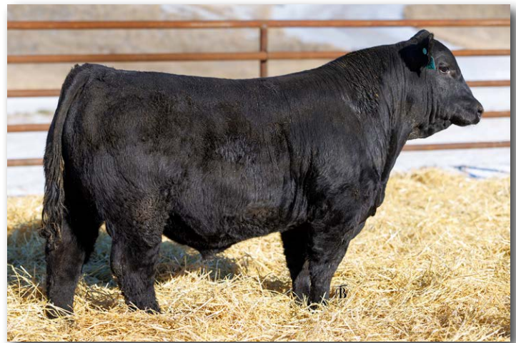
MFSR JUSTICE 054N Sells as Lot 132.