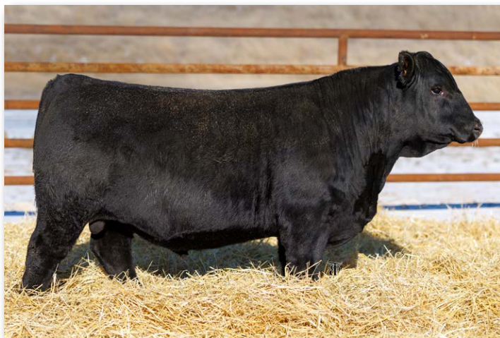
DMS COWBOY UP N47N Sells as Lot 170.

The C-3 Next Up calves are predictable. They come easy and provide attractiveness, muscle, and performance. He matches up exceptionally with heifers and still has the power on the cows. Lot 169 is no exception to the description. He is out of a big framed, high producing cow. He comes with an unmatched EPD profile that will let you use him for whatever you need. Top 4% API and 10% TI. He will be the money making kind.