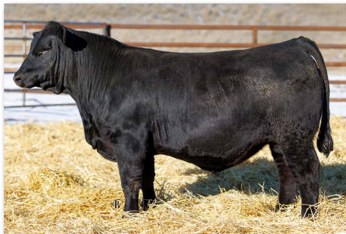
RYMO NEXT TEARDROP N94NM Sells as Lot 173.