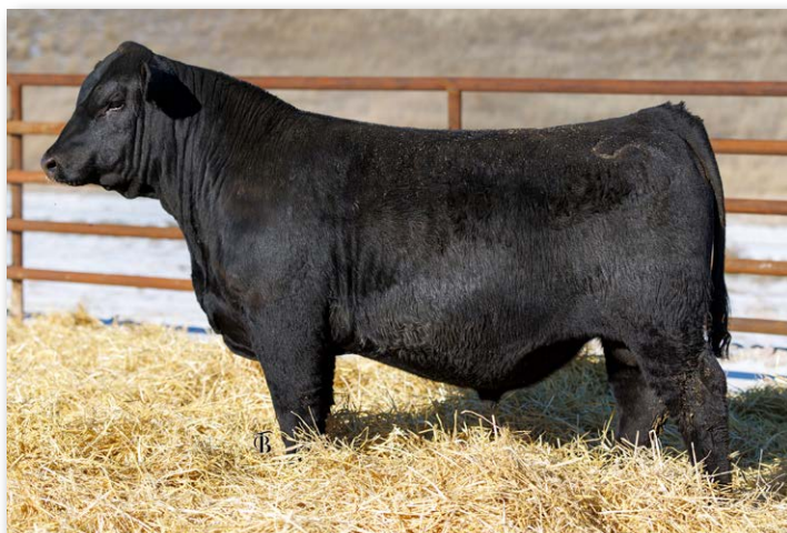
FAUTH MS BONAFIDE 528N Sells as Lot 93.