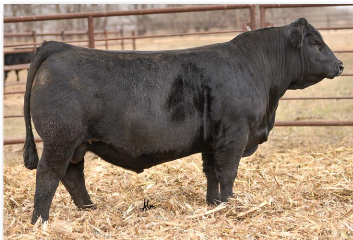
CCR BEDROCK 5171J Sire of Lot 13.

Long sided Bedrock son that has gained well since going on test. A bull to add maternal and carcass merit backed by Bedrock on the sire side and Eclipse on the dam's side.