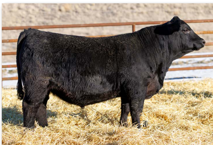
FAUTH MR NU 568N Sells as Lot 87.

This guy is a long, clean fronted Next Up son out of a striking LRS Fake News dam. Comes with a G+ badge and bred to do all things right.