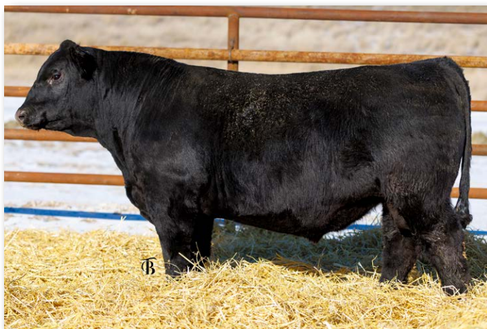
204KJCN Sells as Lot 47.