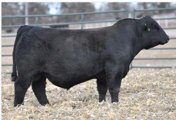
EGL CCR RAWHIDE 137J Sire of Lots 101-104.

This Rawhide son has 6 traits in the top 10% of the breed and is sure to be a crowd pleaser on sale day. Solid ATM bull.