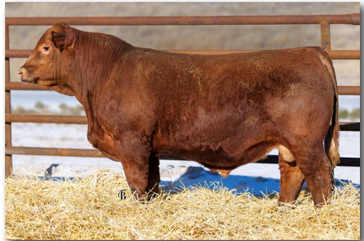
RYMO OUT JUDGED A76N Sells as Lot 233.

As tradition out of our T76F cow, lot 233 is a cool cat. He is long and has loads of power. He has pretty solid numbers across the board but will help with growth, MM, Stay, and Doc. His dam has produced 5 fan favorite bulls out of her 6 calves with a CI of 355 days with ratios of 107 WW and 112 YW. This calf weaned off over the 940 mark. Don't miss this one!