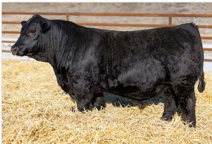
RYMO AMERICN HIGH P43N Sells as Lot 162.