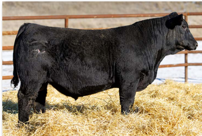
MFSR GENESIS 109N Sells as Lot 129.