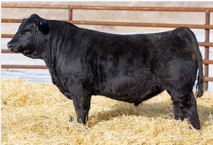
G12LN Sells as Lot 58.

Super good Justice calf, eight traits in the Top 5% of the breed or better. Huge REA at 1.4.