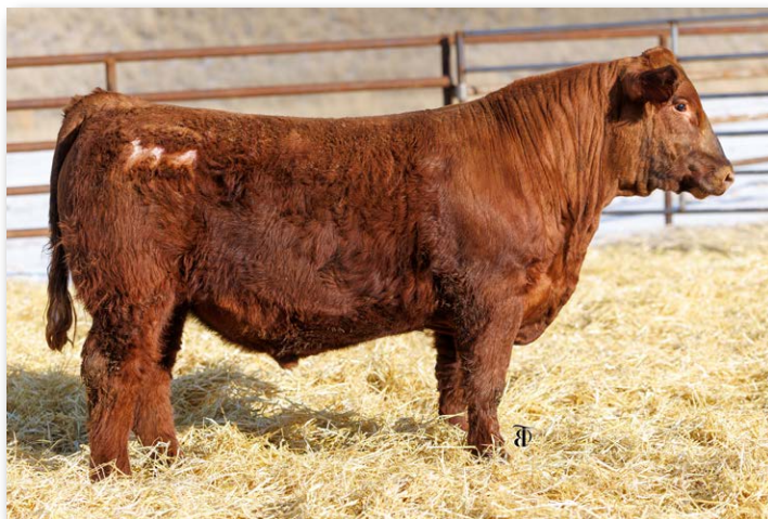
MFSR HILGER ONE 205N Sells as Lot 147.

These Hilger One calves are as gentle as they come. Their good looks and growth is always sought after. These boys averaged over 4 pounds of growth a day.