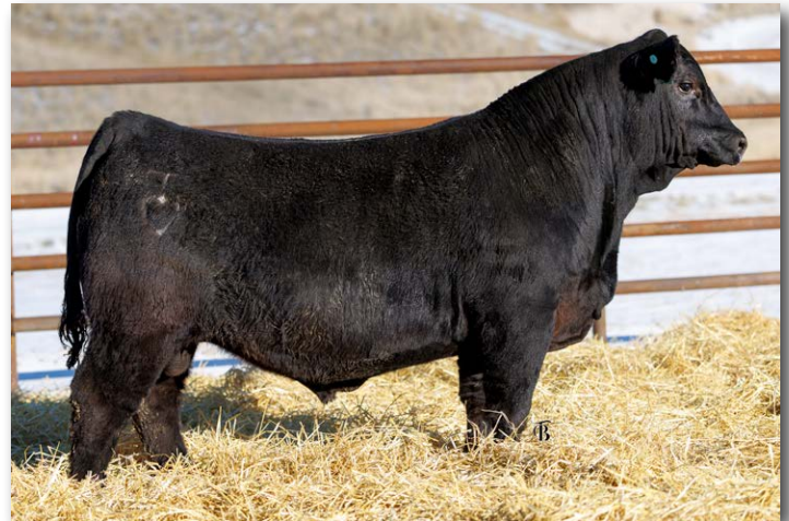
DMS DOMINANT KING G30N Sells as Lot 185.

Lot 185 knows how to get it done weaning off at 905 lbs. and a 112 WW ratio. If you need pounds, he has the power to do it with his top 2% WW and YW EPDs. Not bad overall landing him in the top 15% API and 4% TI. He is deep and all red meat!