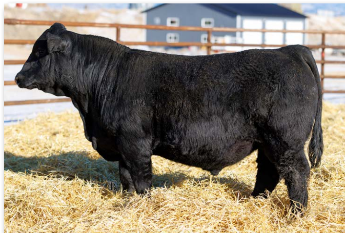
201KN Sells as Lot 55.

Powerful and stout made Genesis son. If you want heavy calves at weaning, this is your guy.