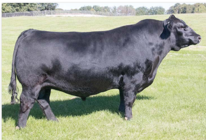
TJ GOLD 274G Sire of Lot 29.

If you're looking for a bull that'll catch your eye, this is the one. He's our big and bold, smooth and level. He's our favorite bull out of this group.