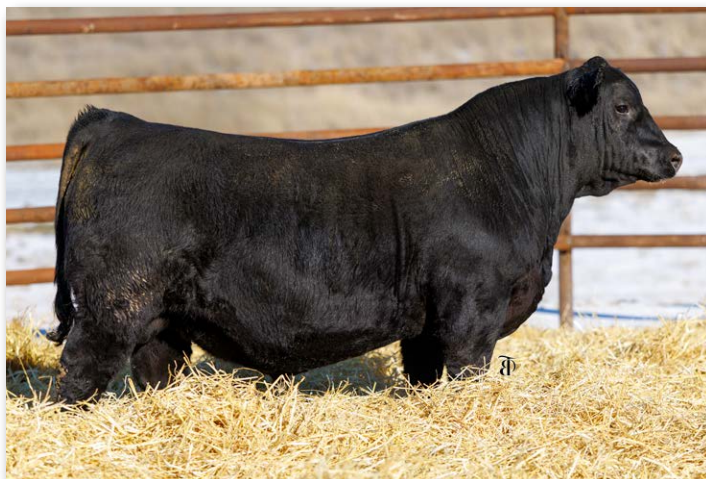
JKK ANTHEM N510 Sells as Lot 23.

Lot 22 is a Jameson son that's lengthy. 8 EPDs in the top 15%.