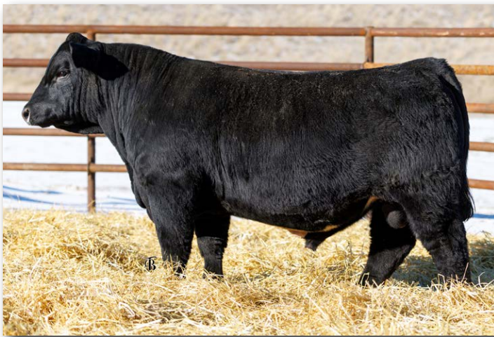
056KN Sells as Lot 57.