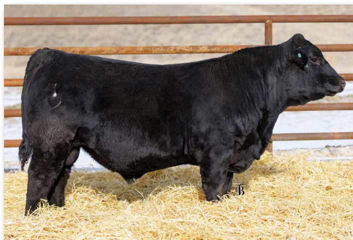
RYMO BEDROCK ROAD H61N Sells as Lot 180.

An excellent match to lot 177. A powerful Bedrock son out of a first calf Homeland daughter. He weaned off over 800 lbs. and has a WW ratio of 105. Check out his WW and YW EPDs. He has a deep rib, which demonstrates his all meat and power type. Super quiet.