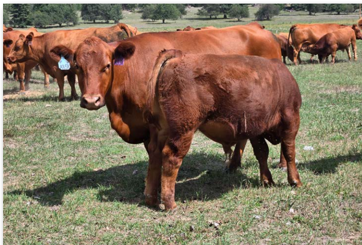
Lot 244 at the side of his dam.

Lot 242 is a more moderate Moab. He is more the chunk style. He has the highest API and TI of the Moab's and will be worth every penny with his exceptional disposition and build.