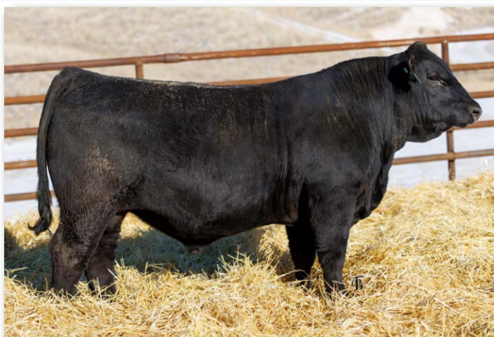
JJK BEDROCK N565 Sells as Lot 28.