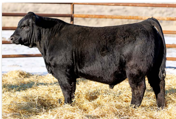
RYMO POWER UP N95N Sells as Lot 174.

172 is out of a bigger framed cow but made a great match with the moderateness of Next Up. Beautifully balanced numbers across the board to rank him in the top 10% for API and TI. His dam raised both calves and weaned off over 1400 lbs. and bred back.