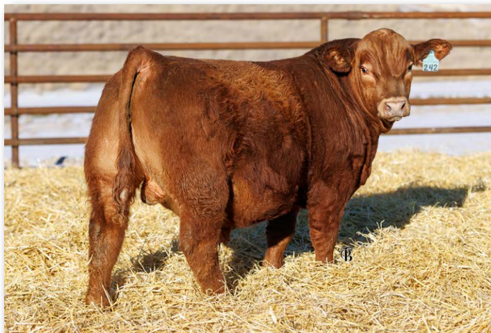
MAXIMUM ARCH B74N Sells as Lot 242.