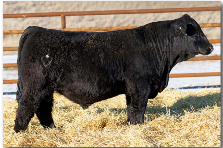
RYMO ENCORE COWBOY 853N Sells as Lot 209.

Lot 209 is deep with a big hip and a little extra size. He ranks in the top 2% for Doc and 10% for Stay.