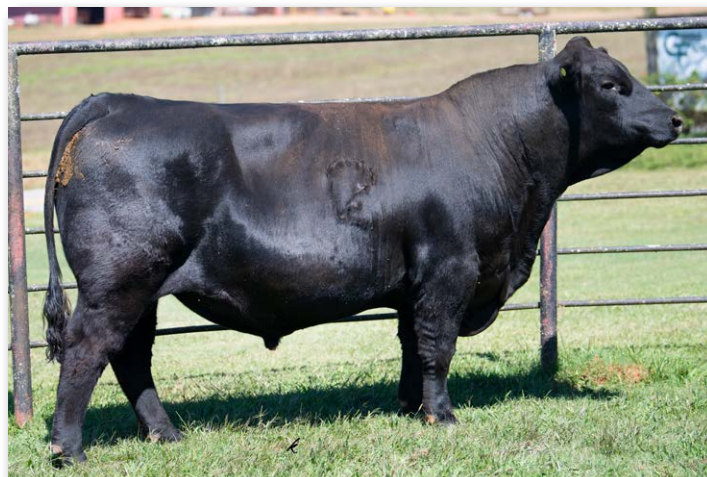
LRS RARITY 983J Sire of Lot 136.