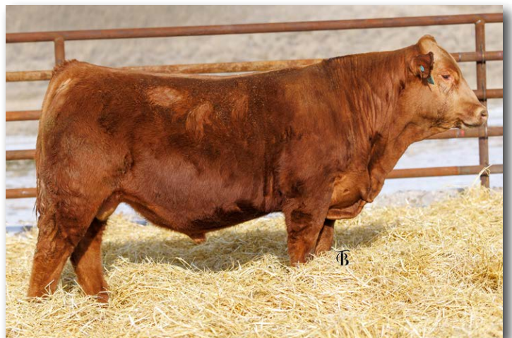
MFSR GRAND JUNCTION 128N Sells as Lot 161.