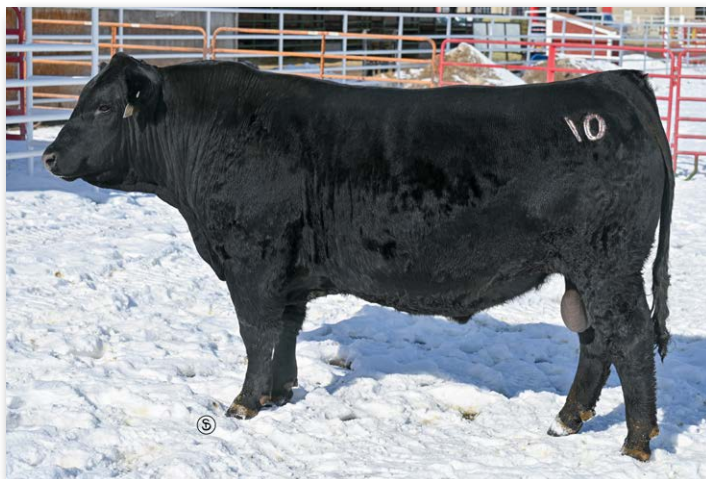
ASR AMERICAN PROUD H0301 Sire of Lots 162, 163.

Super solid American Proud son out of a moderate High Road 2nd calf heifer. Extremely fault free EPDs from end to end. American Proud calves have PAP tested well, make beautiful daughters and come with extra muscle. Lot 162 is moderate with loads of thickness and good feet and legs.