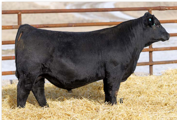
JJK ANTHEM N551 Sells as Lot 20.

Attractive, smooth shouldered, deep ribbed, Anthem son. He'll make your head turn.