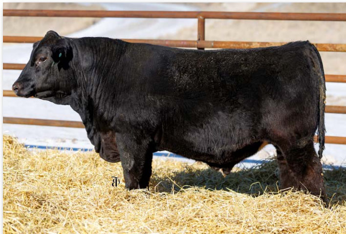
0113HN Sells as Lot 44.

A sweet blaze face bull, out of a first calf heifer. Long and smooth moving bull.