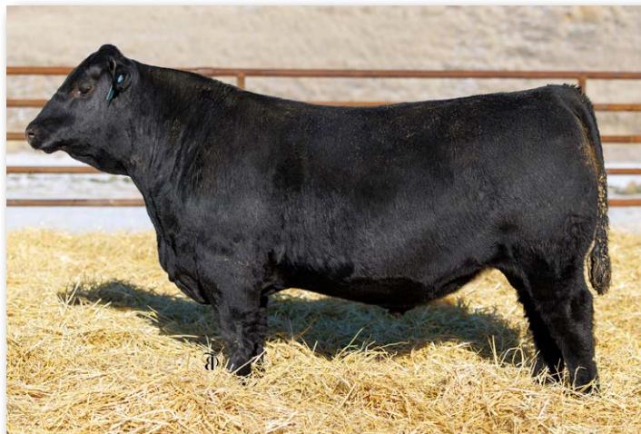
118LN Sells as Lot 39.

Out of a first calf heifer, she did an amazing job and weaned this guy off at 816 lbs. Lots of growth in these Jameson bulls.