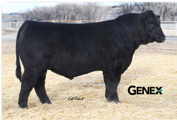
LBRS GENESIS G69 Sire of Lots 129-131.

Not only is lot 130 a Genesis son, his dam was a super Subway cow.