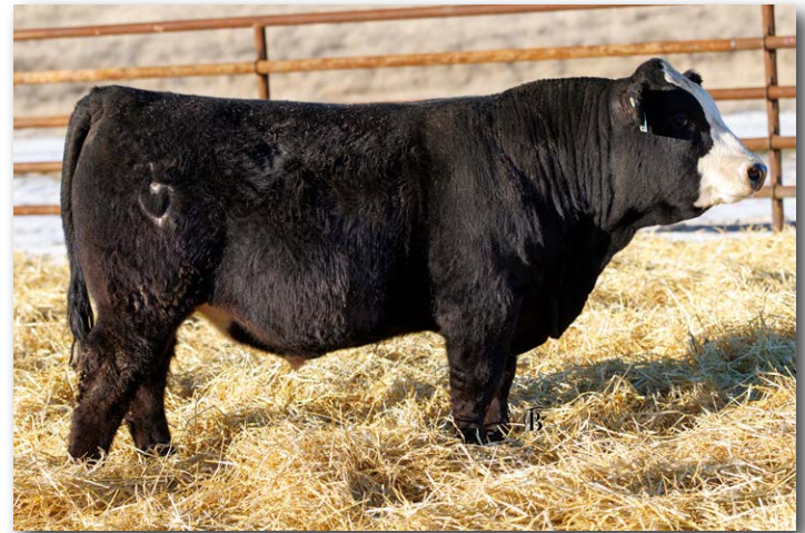
DMS PEAK SCREEN R52N Sells as Lot 199.