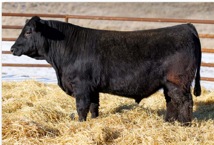
FAUTH MR GUNSMOKE 0121M Sells as Lot 79.

78 is probably the strongest gaining brother in the flush. Lots of mating possibilities with this age advantage bull.