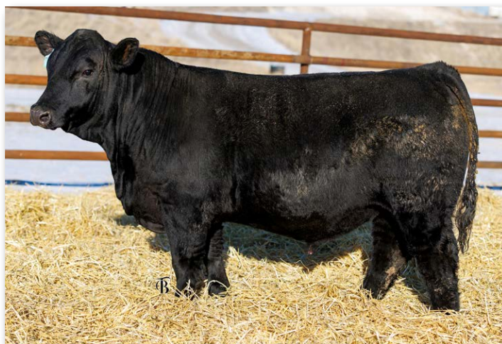
361EN Sells as Lot 49.

Out of JC Mr. Genesis, A bull we got from JC Simmentals in Michigan. Make sure to watch for these bulls in next years sale, they are flat out good.