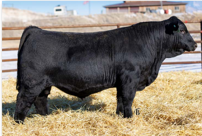
MFSR JUSTICE 210N Sells as Lot 133.