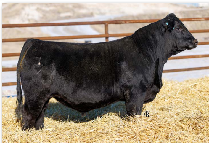
RYMO NEXT ROAD N61N Sells as Lot 175.