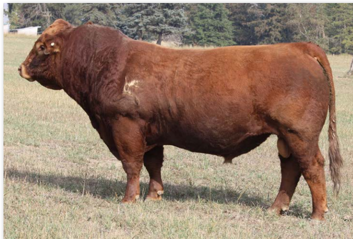
HSF CARDINAL 133G Sire of Lots 224, 225.

HSF Cardinal has proven himself to sire exceptional phenotype with great docility making some of the most beautiful females around. Lot 224 is the biggest framed son of the Cardinals which offers an immense amount of growth and power. A true Cardinal son, his numbers strongly support CE and maternal traits, while he, himself weaned off at 875 lbs and a 116 ratio.