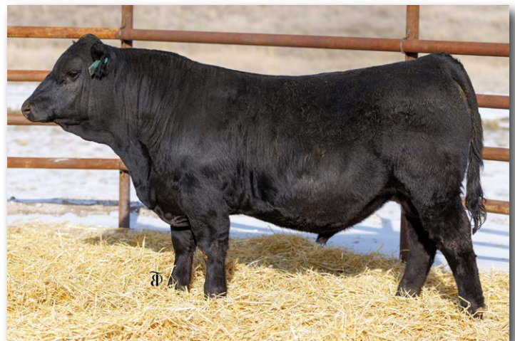
MFSR KNIGHT 041N Sells as Lot 144.

We purchased Gibbs Knight for our power herd sire on our blacks. He is throwing some of the most amazing heifers. Lot 144 is an Essential grandson who looks great.