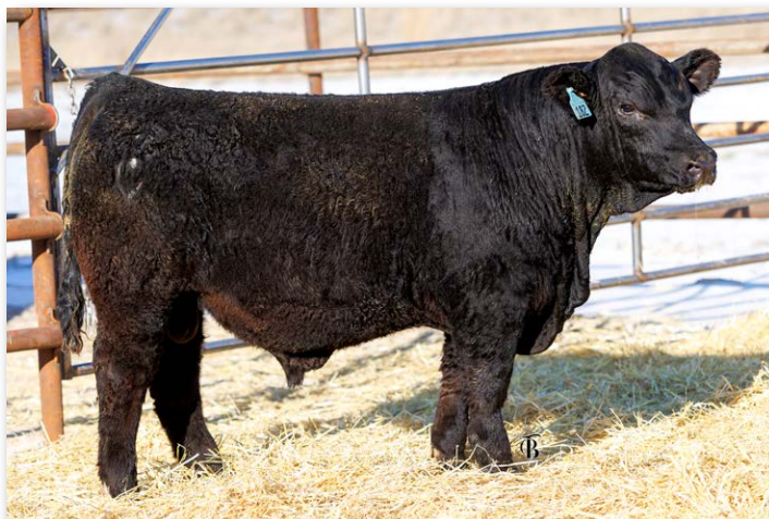
RYMO MONTANA KING G21N Sells as Lot 182.

CLRS King James sons are moderate built with the muscle and dimension of Genesis. Lot 181 is a nice well rounded calf with usefulness end to end. He started little at 66 lbs. but didn't waste much time.