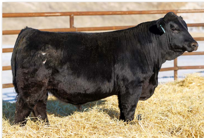
RYMO PATTONS ENCORE B H87N Sells as Lot 179.

Lot 179 is deep, thick and quiet. He is the fancier of the twins. He is packed with growth as well in his EPDs.