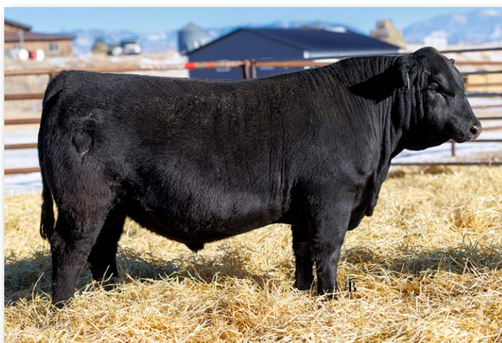
RYMO BED GROUND H83N Sells as Lot 177.

Lot 176 out of the CCR Flint Rock bull used at Heiken Ranch, will catch your eye with his clean design and loaded power. Out of a hard working, moderate cow. He is more nervous and will be well suited for larger herds. Has plenty of growth in his numbers plus a 102 WW ratio.