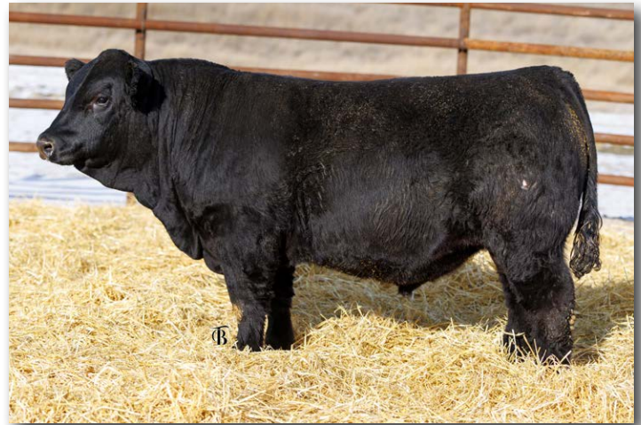
MFSR START FIRST 035N Sells as Lot 142.