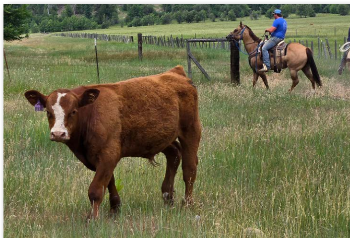
Lot 239 as a calf.

Beautiful RBF Moab son with plenty of length and frame. He comes preloaded with growth and carcass traits and ranks in the top 15% for ADG. Nice calf that will add dollars to the bottom line and look good doing it.