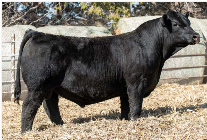
LRS DUTTON 611K Sire of Lots 213-217.

Picture perfect EPD profile landing lot 215 in the top 10% API and 15% TI. Out of a nice 2nd calf heifer. Same cow family as Lot 216.