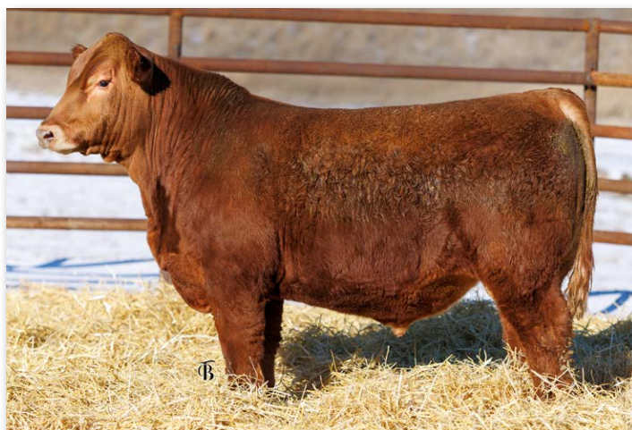
RYMO DESERT BEEF B65N Sells as Lot 241.

Another powerhouse Moab calf that has lots of potential. Top 25% API and 15% TI makes him pretty darn useful. He weaned off just shy of 1000 lbs. His dam has 108 WW and 104 YW ratios. Her calves grow.