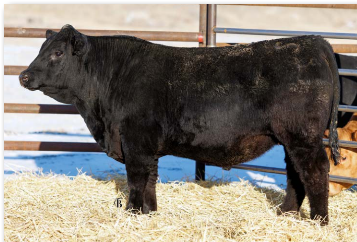
FAUTH MS JJ 513N Sells as Lot 96.

96 is another Jesse James son, by another great Genesis heifer. This bull is a more moderate than 95, but look at his type!