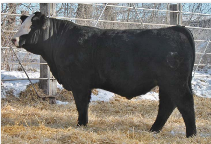
KBHR SCREENSHOT K167 Sire of Lot 59.

Thick, moderate heifer bull. Started at 60 lbs and weaned off at 705 lbs. from a first calf heifer.