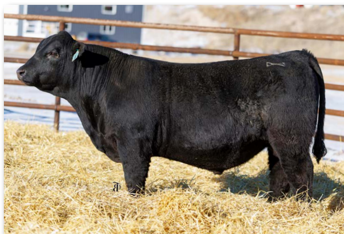
LBRS NASH N251 Sells as Lot 8.

Twin to lot 7 and very similar in his makeup. A bull with a ton of mass and rear quarter that will pack the pounds on your next calf crop. Kayla's ratios on her natural calves have been 95 BW, 108 WW and 103 YW.