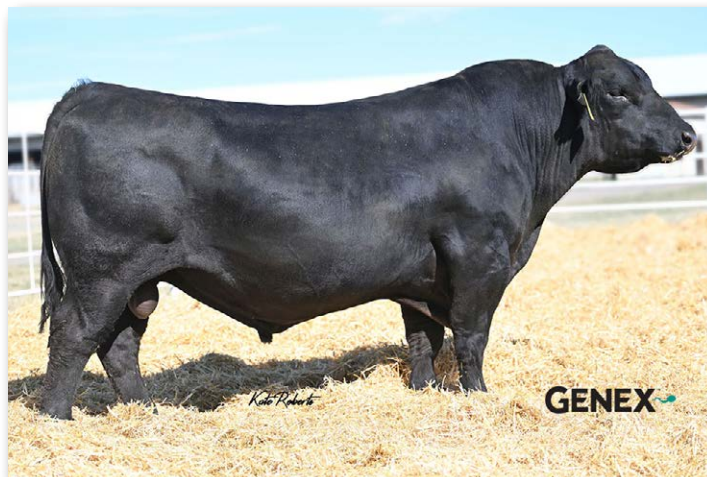
GIBBS 9114G ESSENTIAL Sire of Lot 192.

Gibbs Essential is the highly proven powerhouse growth bull of the breed. You can plan on performance. Lot 192 is no exception out of a second calf heifer. He weaned off at 850 lbs with a 110 ratio. He has a no holes EPD profile.