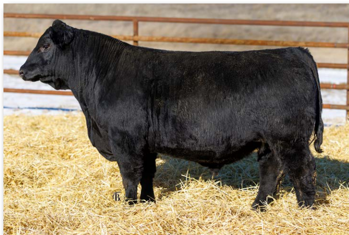
205HN Sells as Lot 40.

Top 3% WW. Top 5% YW. One of my favorite Jameson Bulls.