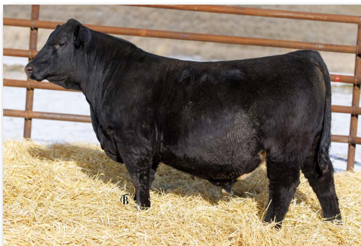
RYMO KENWORTH CINCH 914N Sells as Lot 164.

163 is a uniquely bred calf that could add the heterosis you are looking for in a new genetic package. He certainly could make some excellent replacement heifers with his great DOC, MM, and stay.